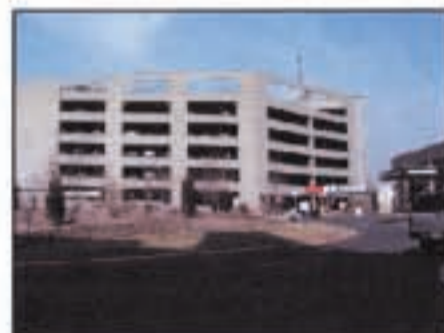
G. Parking Deck P3 (P3)