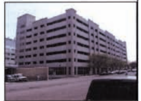
D. Parking Deck P2 (P2)