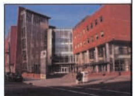
S. International Center for Public Health (ICPH)