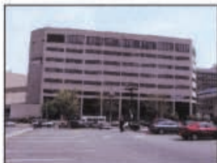
F. Doctors Office Center (DOC)