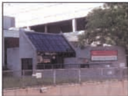
J. Radiation Oncology