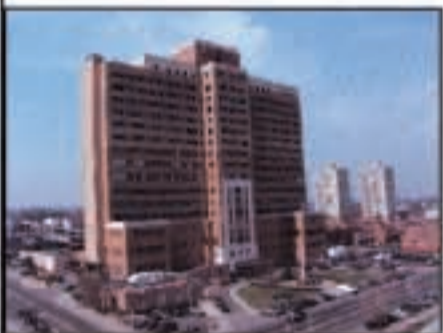
A. Stanley S. Bergen, Jr. Building (SSB)