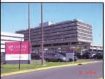
M. Medical Science Building (MSB)