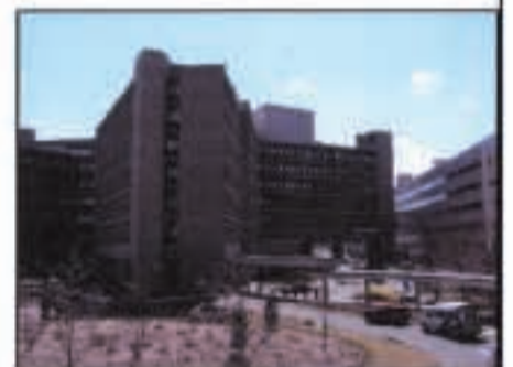
H. University Hospital (UH)