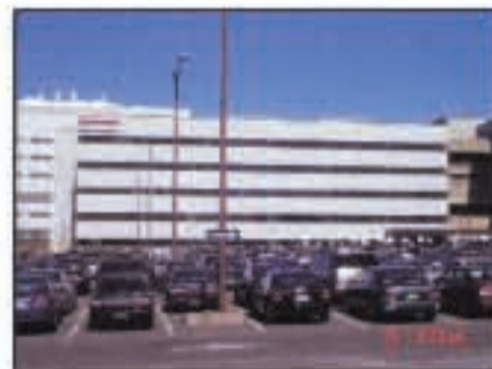
K. Behavioral Health Sciences Building (BHSB)