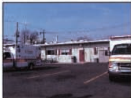
C. Emergency Medical Services Building (EMS)