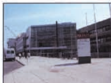
O. 12th Avenue Pavilion (Dental School Expansion)