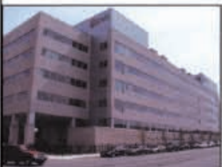
E. Ambulatory Care Center (ACC)