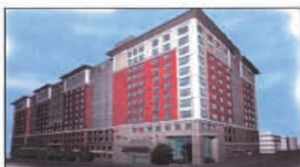
R. University Housing