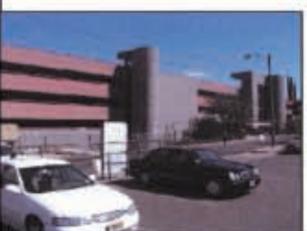
Q. PARKING DECK P1 (P1)