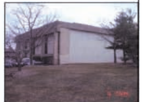
L. George F. Smith Library (LIB)