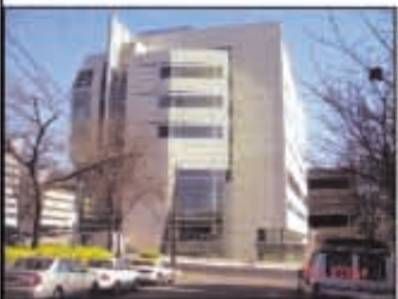
I. Cancer Center (CC)