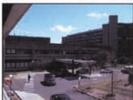
N. Dental School (DS)