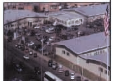
P. Administrative Complex (ADMC)