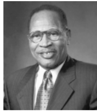
Hon. Sharpe James Mayor Newark, New Jersey

First, as I have often said, we see a Newark emerging that will be an economic engine for all of Northern